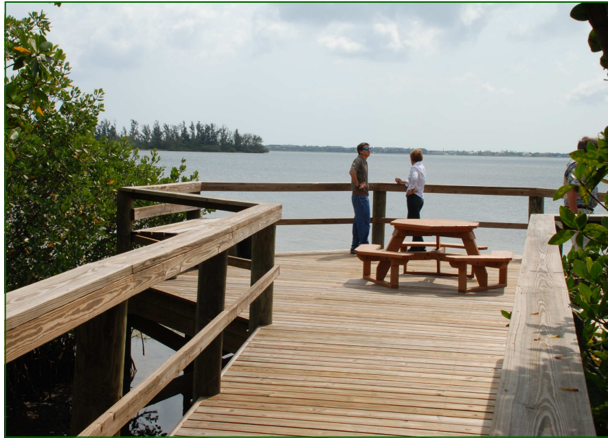
Prototype for Greenway Observation Deck