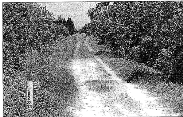
Vero Beach 32963 / July 30, 2009